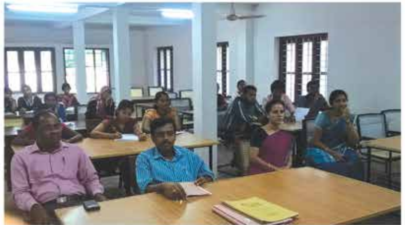
Live Kerala Budget Viewing