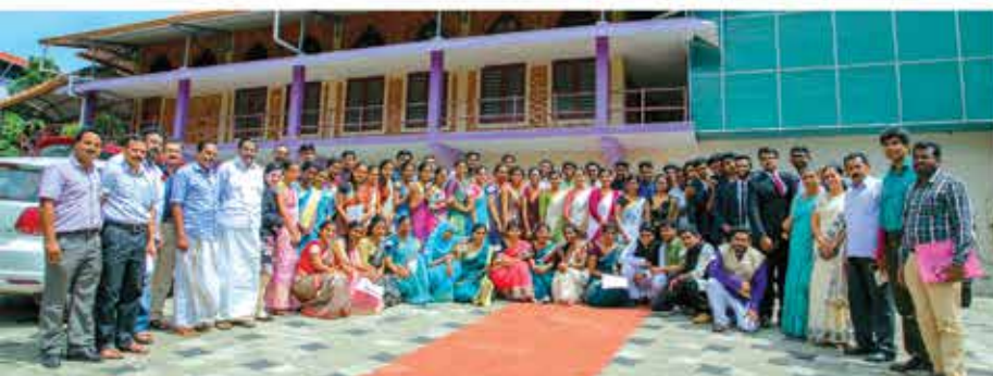
Revenue officials conducting voter's list enrolment awareness programme for students on 21 July 2017