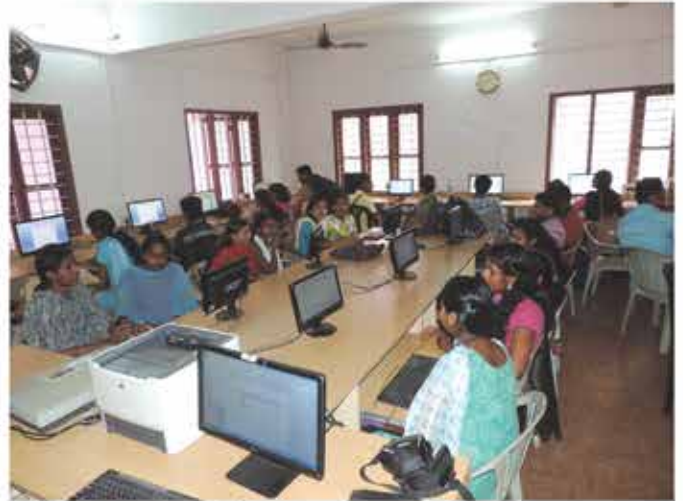
Add-on Course in MS Office