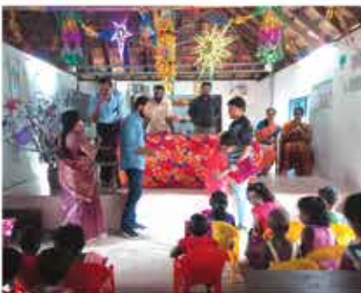
Christmas Celebrations with students of Malayil LP School.