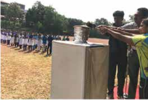
Lighting of the Torch