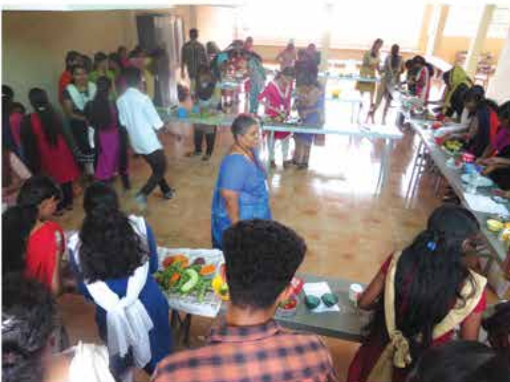
salad making competition, organised by health club on 9th March 2018.