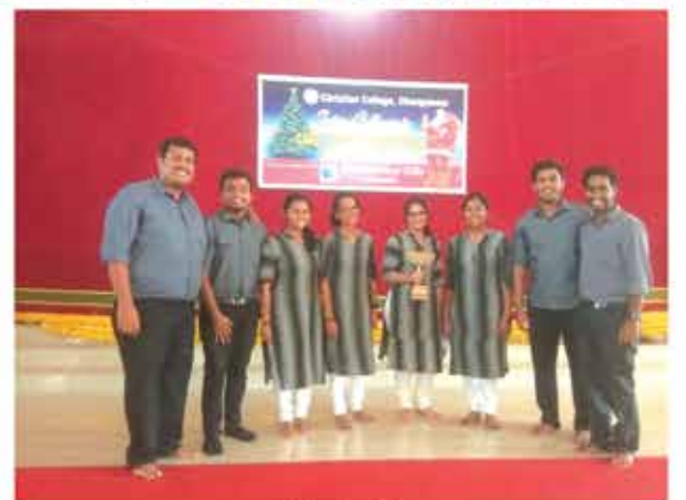
First prize winners of the Inter Collegiate Carol singing competition 2017: CMS College, Kottayam