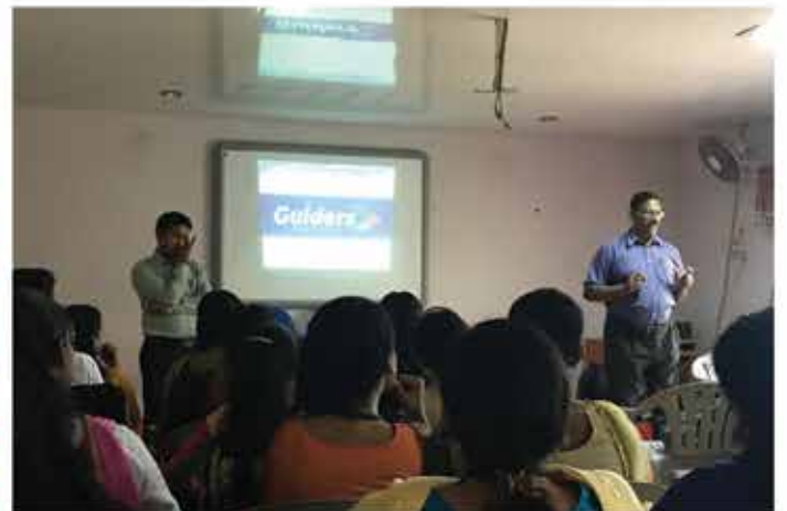
Guiders International conducting career guidance classes on job opportunities in the field of Aviation and Tourism