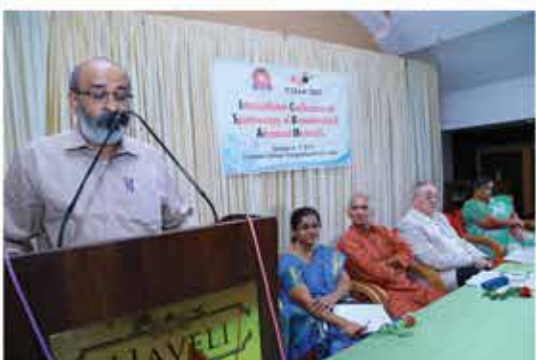
Hon. Minister for Water Resources Adv. Mathew T Thomas inaugurating the valedictory function

The International Conference on Spectroscopy of Biomolecules and Advanced Materials (ICSBAM 2017) was organized by the Christian College, Chengannur(Hosted by the Departments of Physics, Chemistry and Zoology, Christian College, Chengannur) during 04-07 October, 2017 at Haveli Backwaters, Alappuzha . Spectroscopy has become a highly interdisciplinary scientific tool. The ICSBAM 2017 provided a global platform for the research community to meet, discuss and share the latest advances in the field of spectroscopy with a large number of internationally reputed spectroscopists