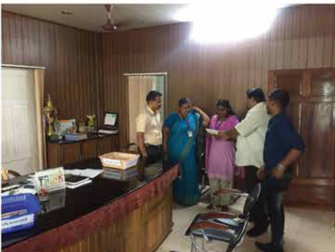
M and M international conducting career guidance classes and giving cash award for winner of English competency test on 20.3. 2018