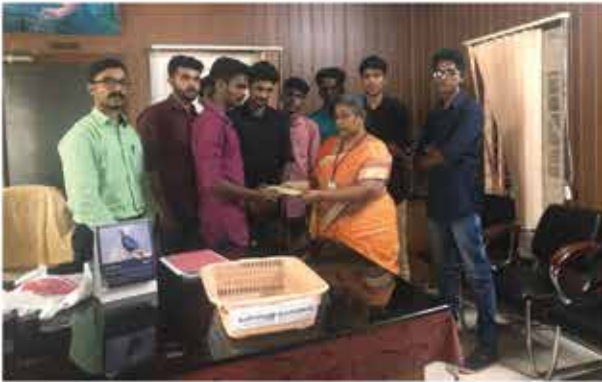
Principal handed over Rs14000 for the medical expenses of a needy student