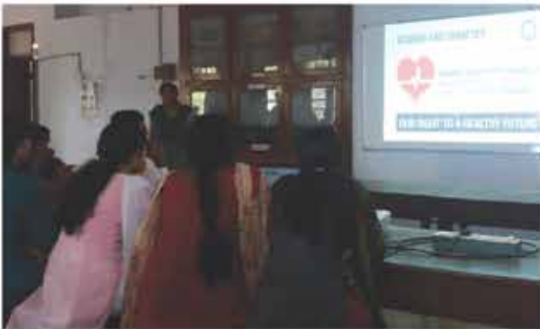
Discussion on Women and Diabetes on World Diabetes Day