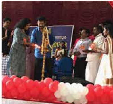
College Union inauguration by Chintha Jerom, Chairperson Kerala Youth Commission