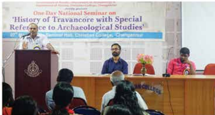
National seminar and exhibition on, 'History of Travancore with special reference to archaeological studies'