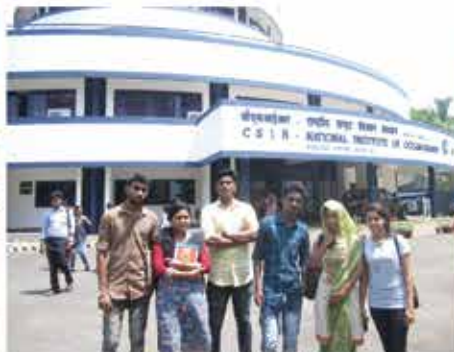
Institutional Visit to NIO Kochi