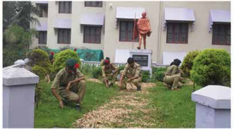
Cleaner Greener Campus