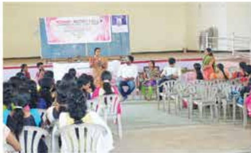
Debate on, 'Streeyum Thozhilum' on the occasion of Womens' Day, held on 7th March 2018.