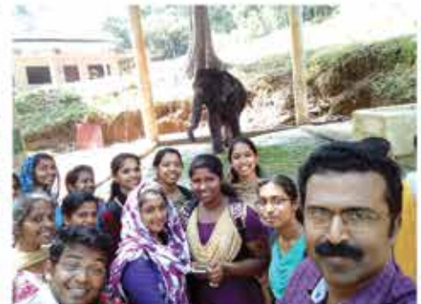
കാടൻ്റെ & ആനയൻ്റെ Program at Konni Eco Tourism Centre