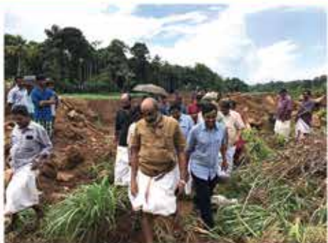
'PUNARNAVA' Rejuvenation of river Varattar Organised by various Social Service Clubs