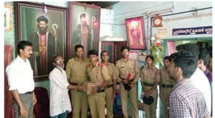
NCC cadets visited St Andrews Pain and Palliative Care Centre, Puthenkaavu, Chengannur. The centre had 50 members and the cadets distributed food packets to the inmates.