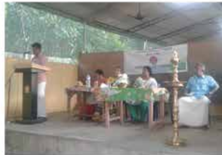
NSS Annual Camp inaguration