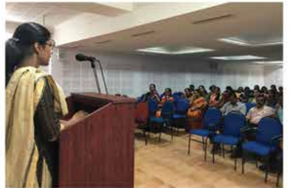
India Post Asst. Divisional Manager introducing various products and services