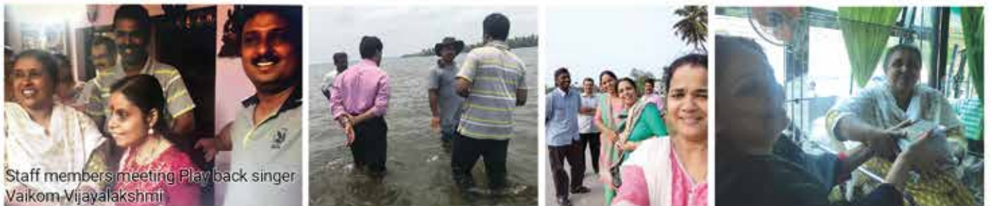
Staff members meeting Playback singer Vaikom Vijayalakshmi