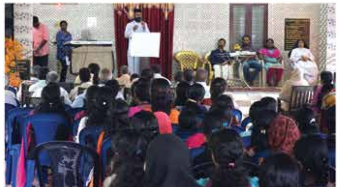
The students of History Department paid a visit to St. Mary's Dayabhavan (an old age home) situated at Kollakadavu on 21 October 2017