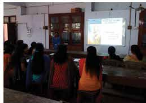
Observance of National Bird Watching Day