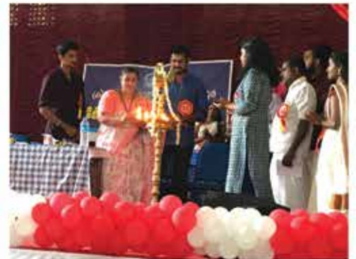
Arts Club inauguration by Kailash (Cine Artist)