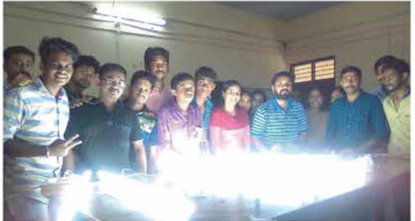
One day training was provided to selected students on Fabrication and Installation of LED tube-lights by "PROXY DEVELOPERS," a startup venture by B.Tech Students of College of Engineering, Chengannoor