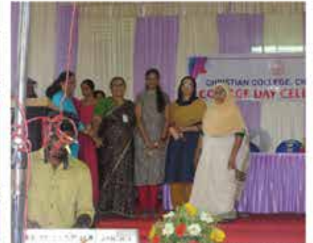
Shafi Memorial Proficiency Prize by Snehakood