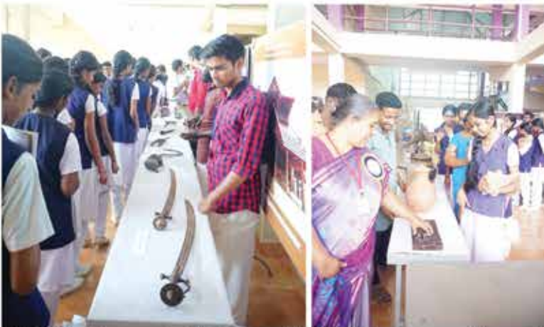
One day national seminar and two day exhibition on, 'History of Travancore, with special reference to archaeological studies' was organised by Department of History in association with State Archaeology Department on 6 and 7 March 2018