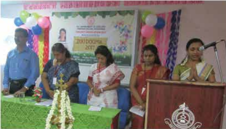
A Prayerful beginning to the inauguration of Zoology Association