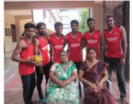
College Volleyball team