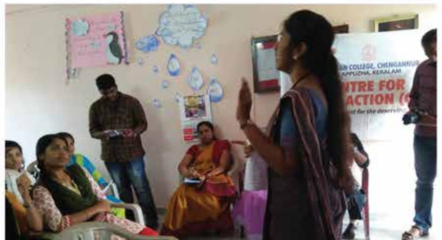
Members of Koottu, the registered charitable trust formed by former students of the University of Kerala, addressing the Scribe Volunteers of the college