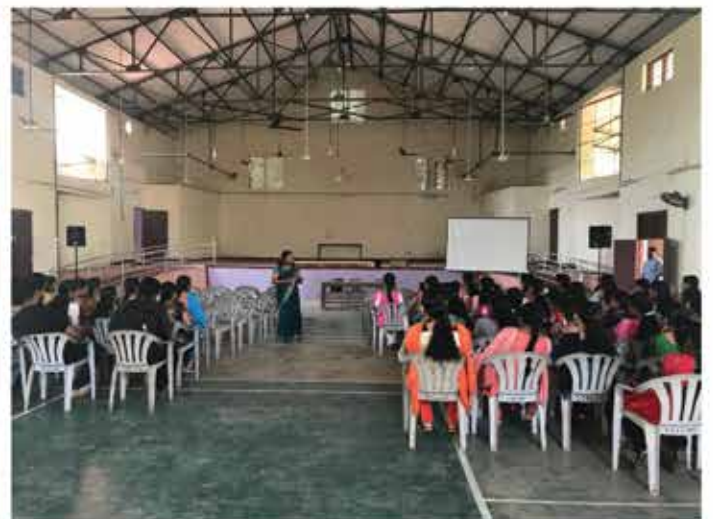
Training and registration with District Employability Center, Government of Kerala on 9-2-18. 25 students of final year BA/BSc registered.