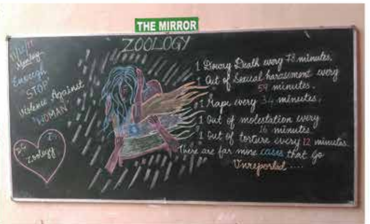
Mirror Competition : 1st prize Dept. of Zoology