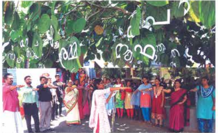
മാതൃഭാഷാദിന പ്രതിജ്ഞ - അക്ഷരമരണങ്ങളിൽ മാതൃഭാഷാദിന പ്രതിജ്ഞ