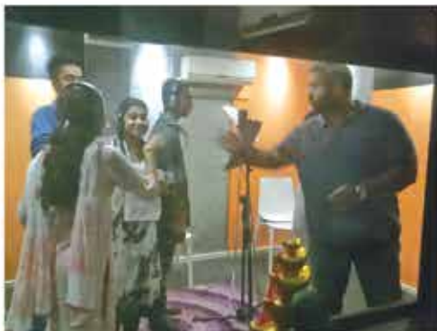
I DC Students dubbing the play, 'The Refund' at "Pattupetty" Music Studio Chengannur