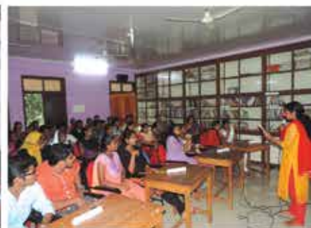
Quiz Competition organised by Economics Association