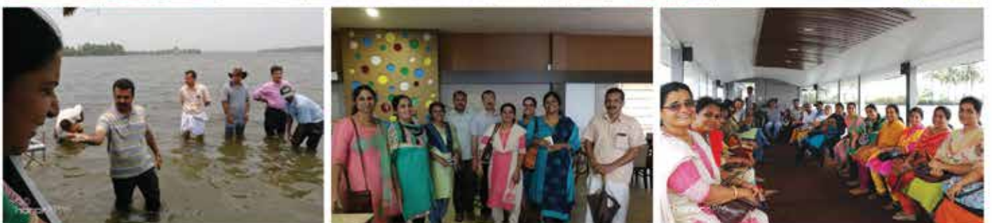
Staff tour to Palaikara Fish Farm