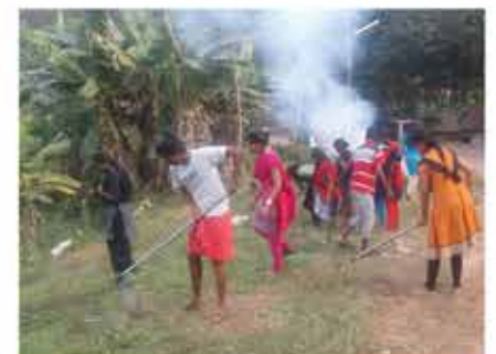
Public road cleaning