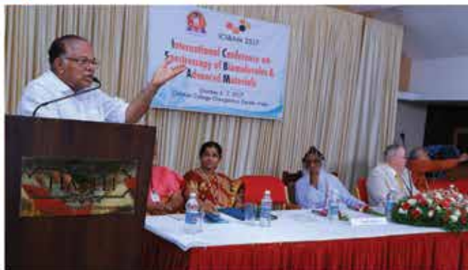
Prof. P.J. Kurien, Hon. Deputy Chairman of Rajya Sabha inaugurating the Conference