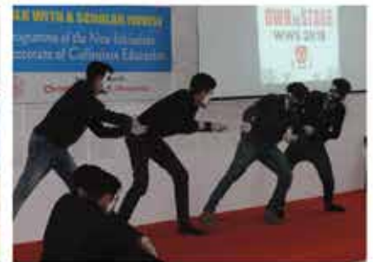
Performance Competition 'Own the Stage' organised by II Year WWS Mentees