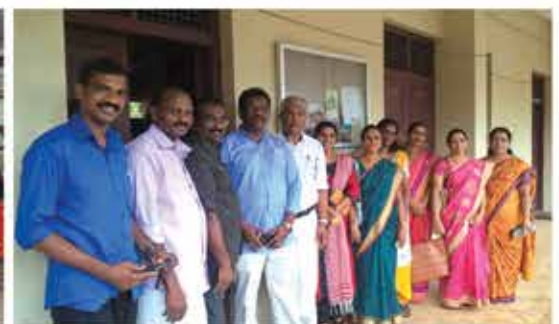
Alumni Meet 1989-92 Batch