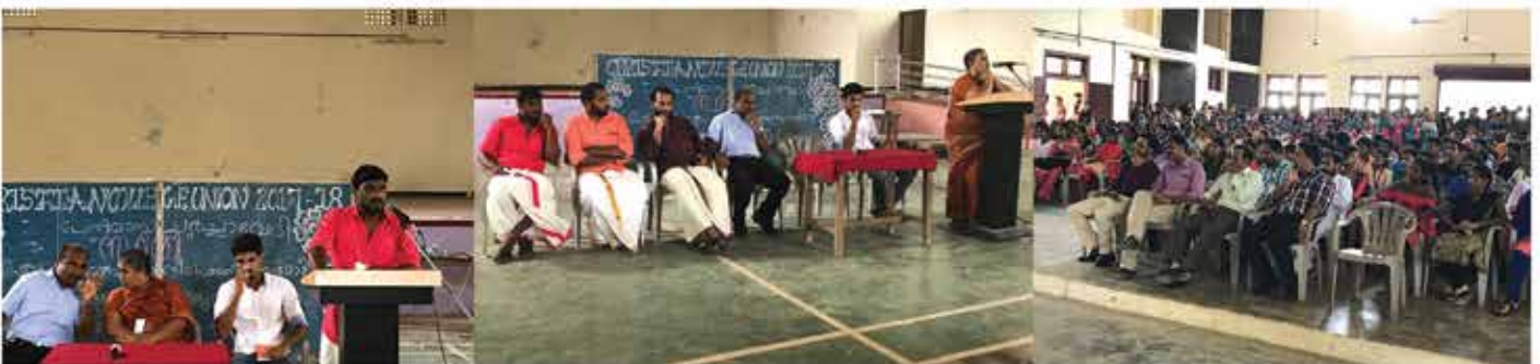
College union monthly discussion forum - Is campus politics inevitable?