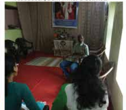
Social Internship Programme by II DC students at St. Andrews Pain and Palliative Care Centre, Chengannur