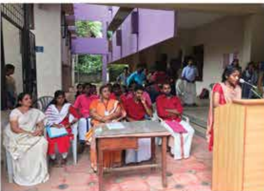
Swearing-in ceremony of Students Union of Christian College