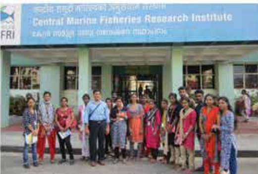
Institutional Visit to CMFRI Kochi