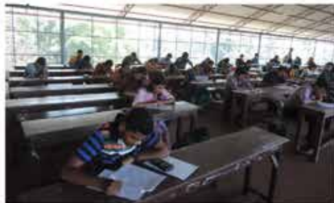
Mock PG Entrance Exam conducted by WWS Mentees