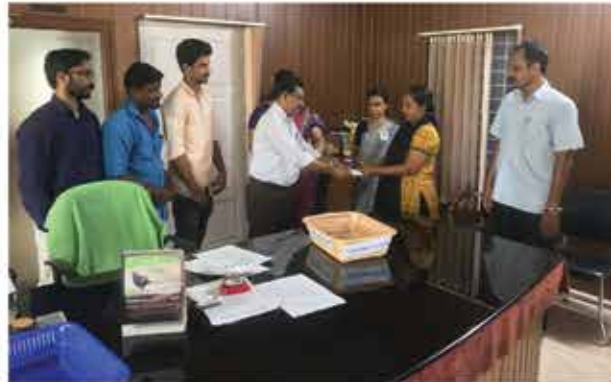
Principal handed over Rs.15000 for the medical expenses of a needy student