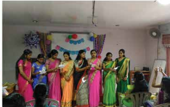
Christmas carol by PG. students