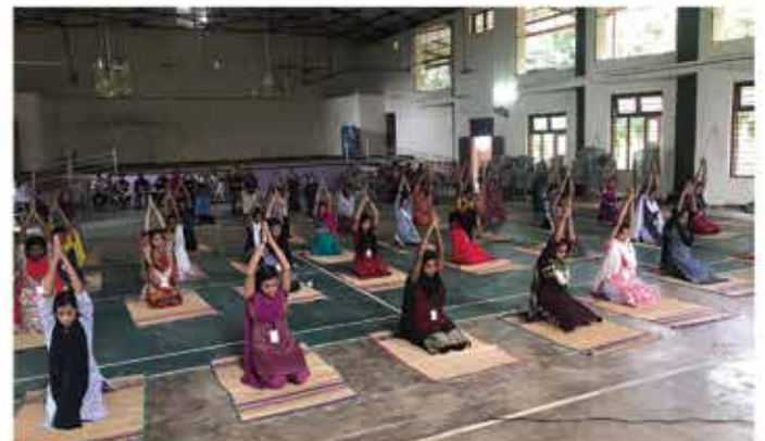
Students and teachers took part in international yoga day celebrations.