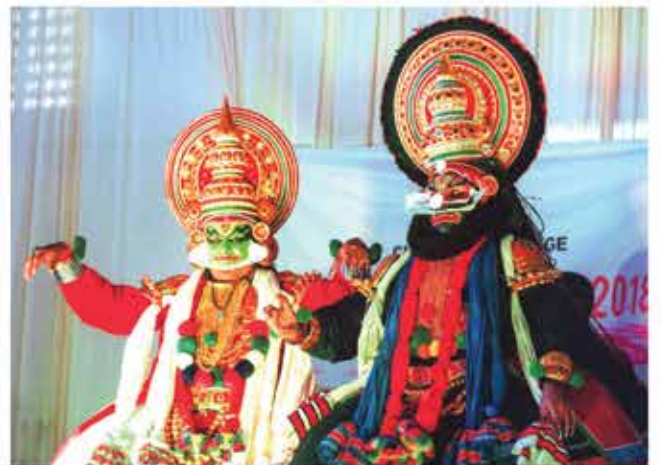
കഥകളി രംഗപാഠം - നളചരിതം ആട്ടകഥ (രാജാം ദിവസം)