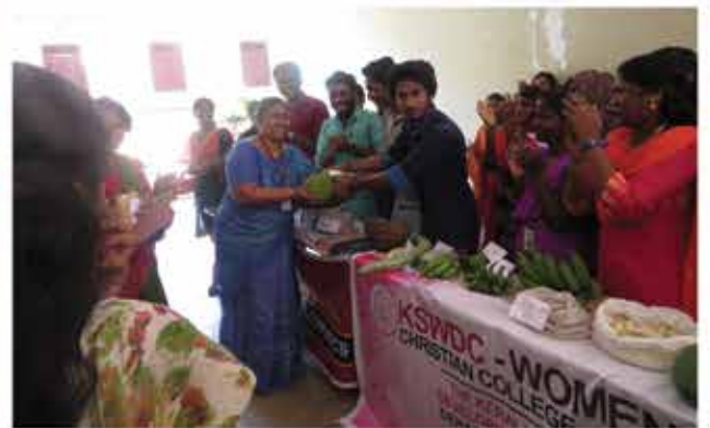
Sale Organic vegetables cultivated by students of the Health club. The proceeds from the sale was used for charity.