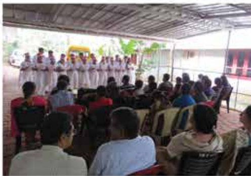
Students and Staff celebrating Christmas at Thejus, the Charitable Society for the children with multiple disabilities