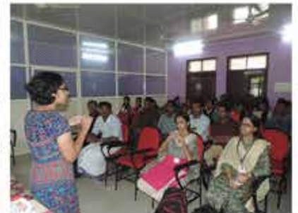
Session on Preparation for PG Entrance Exams