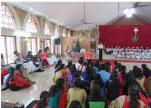
Christmas celebration with the paraplegic