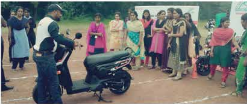
National Service Scheme organised an awareness programme on 'Safe Drive Save life' in Association with Honda on 5.10.2017 at Christian College, Chengannur.