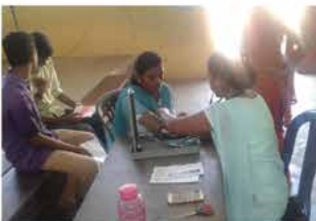
Free medical camp in association with Century hospital chengannur