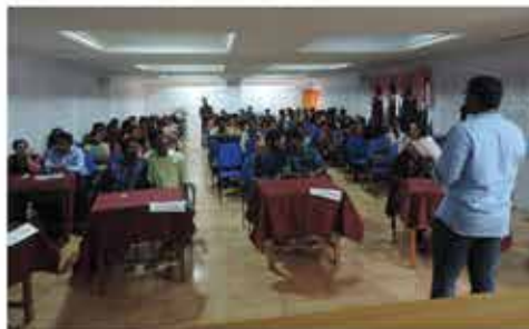
Inter-department Quiz Competition Organised by WWS Mentees