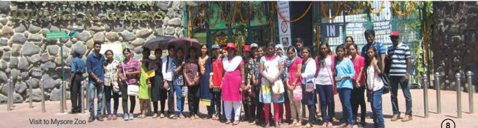
Visit to Mysore Zoo