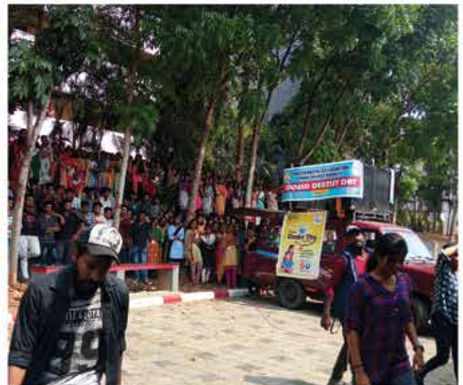
The Health club in association with Indian Dental Association conducted an Anti Drug Awareness programme on 6-3-18. A skit discouraging students on the use of tobacco on campus was performed.