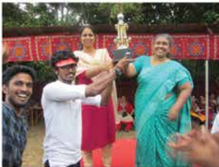
College overall championship to Red House