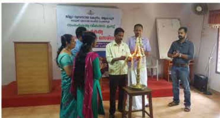
Inauguration of Entrepreneurship Development Club