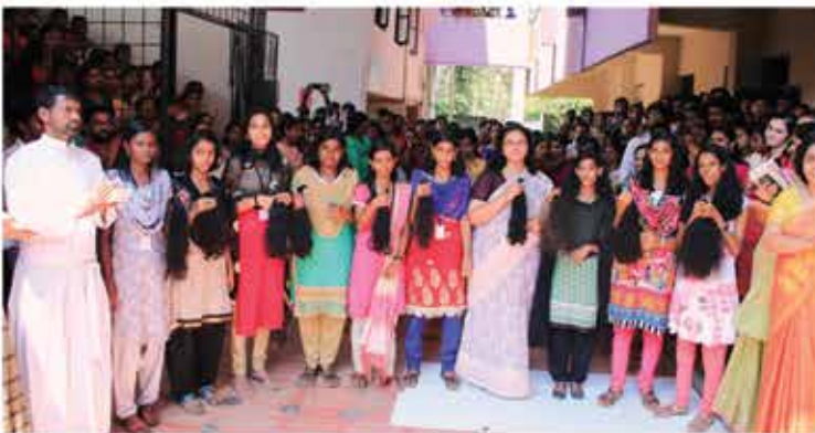
Hair donation for cancer patients by Womens Cell and UNAI