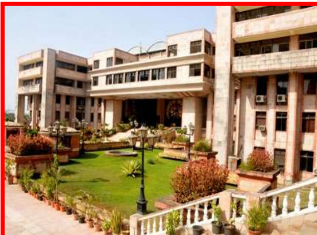
ICAR – CIFE, Mumbai