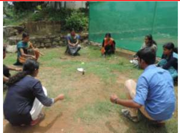
Activity based Training at MACFAST