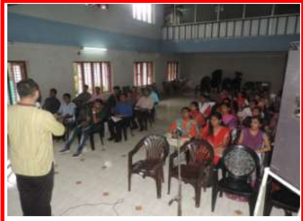
Mentees Practicing Breathing Techniques during the Session