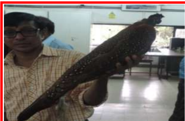
Stuffed Specimens shown to the mentees at Bombay Natural History Museum