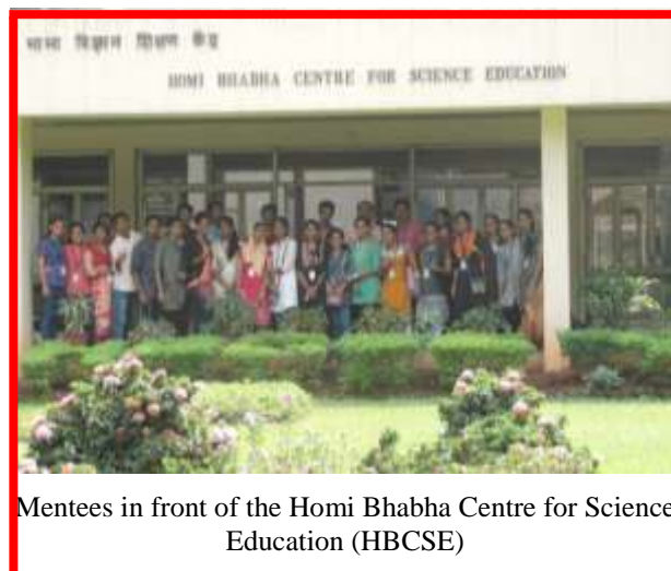
Mentees in front of the Homi Bhabha Centre for Science Education (HBCSE)