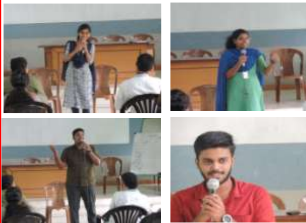
First Year Mentee Feedbacks after the five day sessions