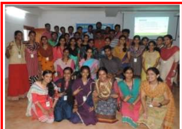
Prize Winners with Mentees