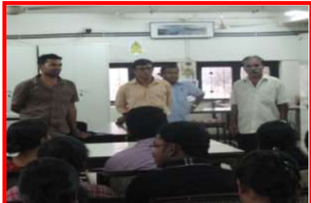
Mentees in front of The Bombay Natural History Museum, Mumbai