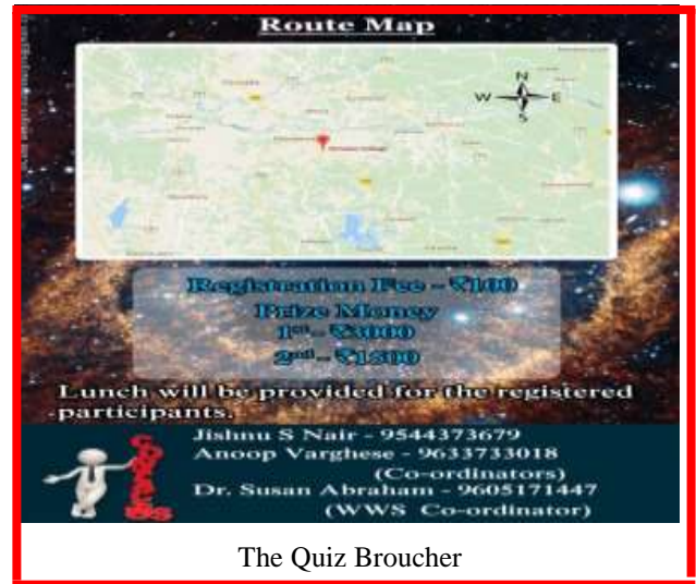
The Quiz Broucher