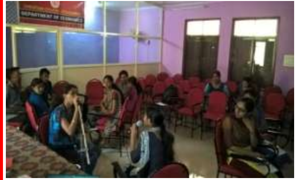
Mock Interview by Mentees