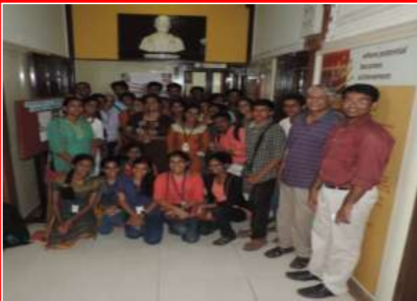
Mentees with the Director and Dean of XIC