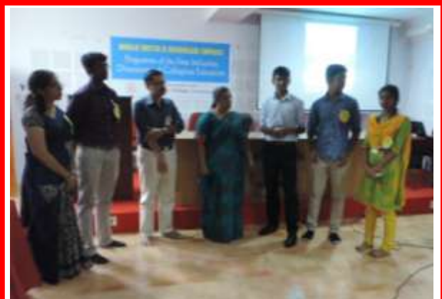
Third and Second Year Student Co-ordinators with the Principal and IQAC Co-ordinator