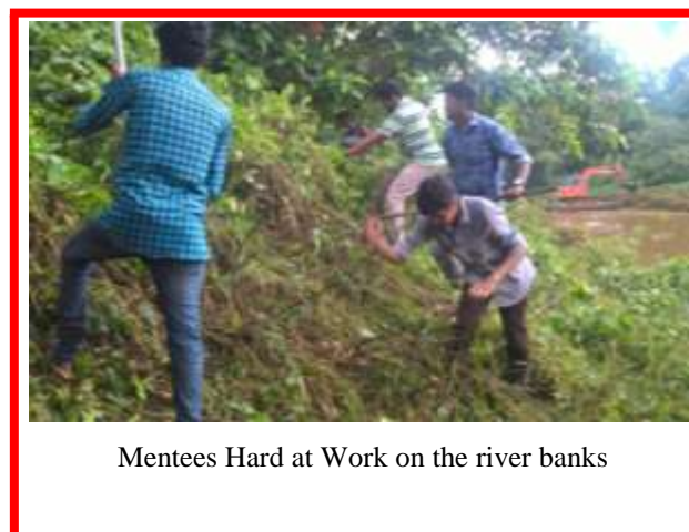
Mentees Hard at Work on the river banks