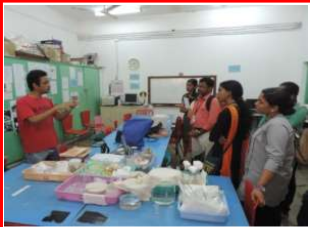
Mentees at the CUBE Laboratory, HBCSE