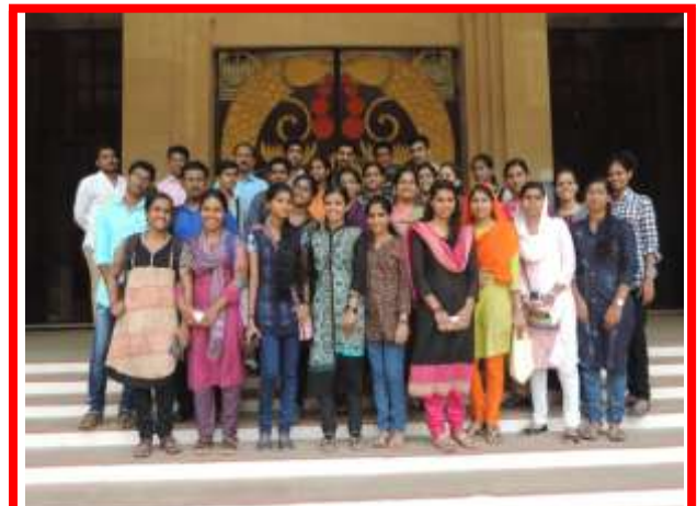
Mentees at ICAR-CIFE Mumbai