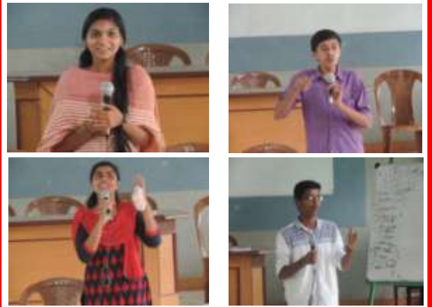
Second year Mentees Providing Feedback after the five day sessions