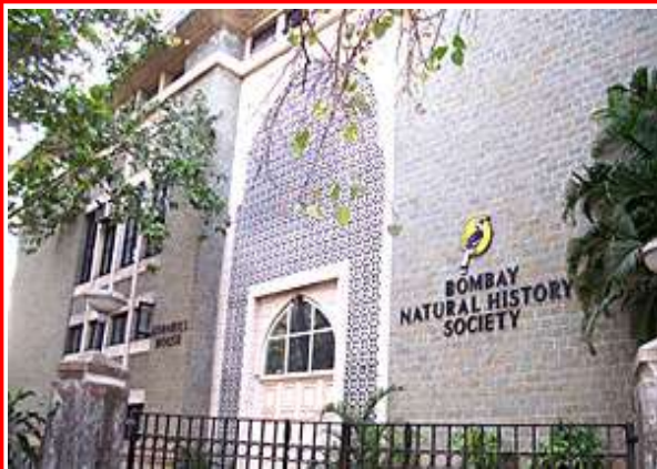
The Bombay Natural History Museum, Mumbai