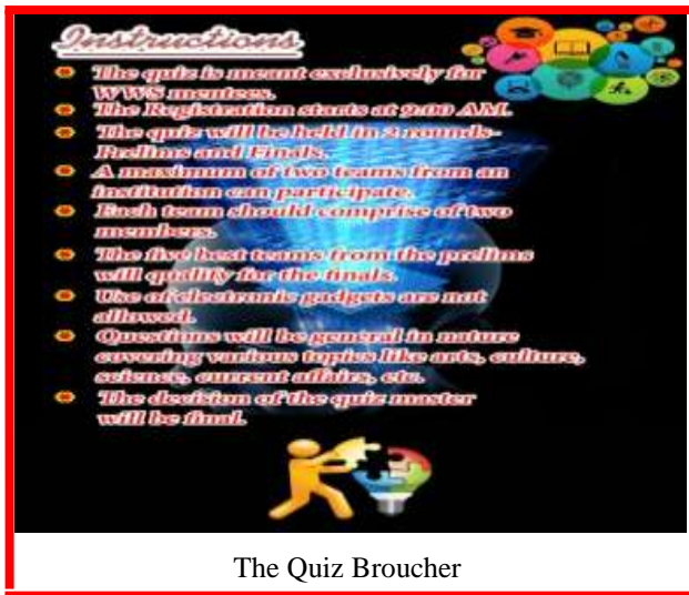
The Quiz Broucher