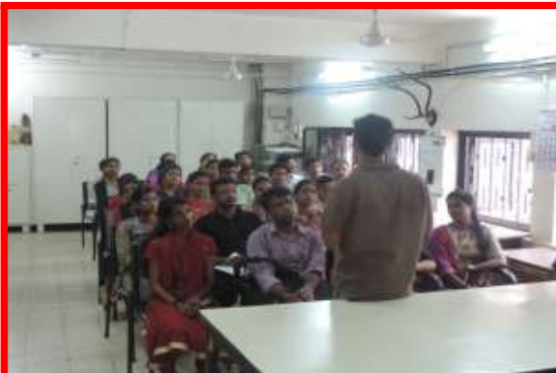
The Bombay Natural History Museum, Mumbai