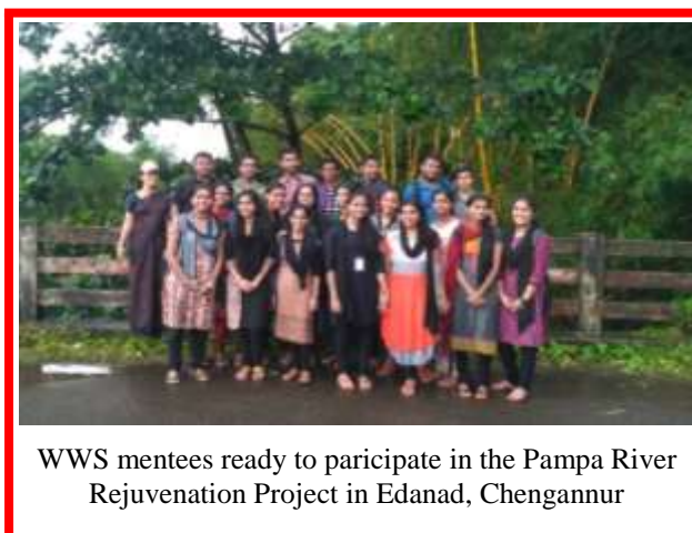
WWS mentees ready to participate in the Pampa River Rejuvenation Project in Edanad, Chengannur