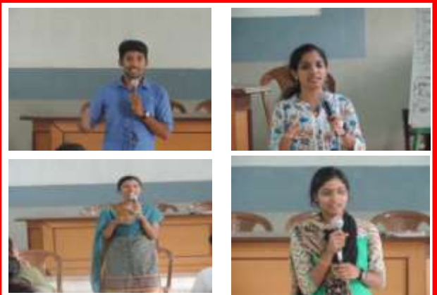
Second Year Mentees Providing Feedbacks