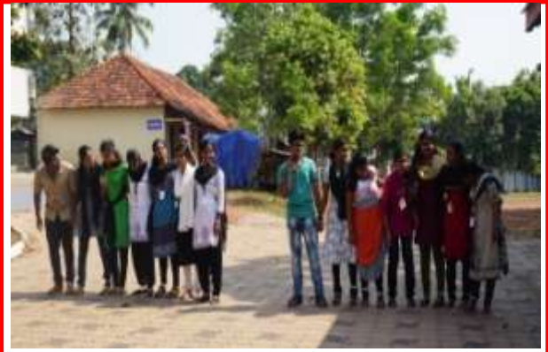
The Mentees Interacting during the session