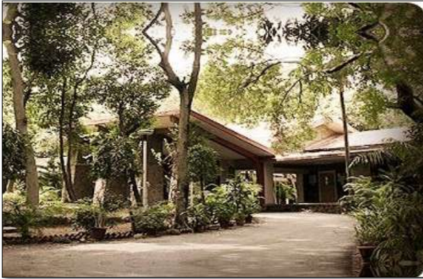
The Tata Institute of Social Sciences, Mumbai