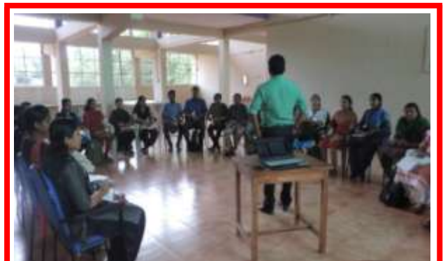
Mentees Briefed before Commencement of Mock Group Discussion