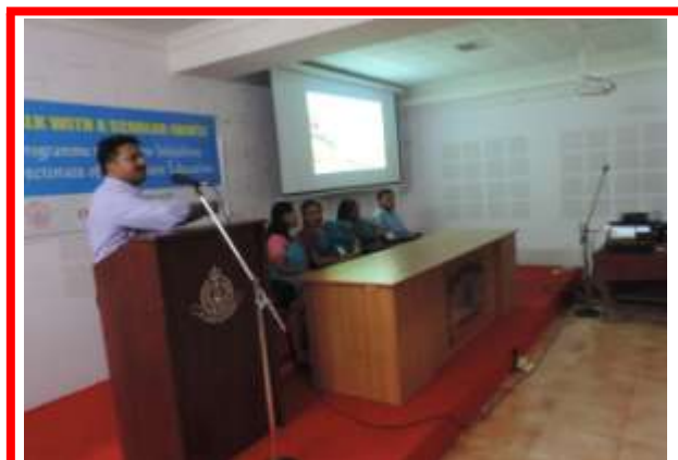
Judges' Remarks on Conjour UP 2K17