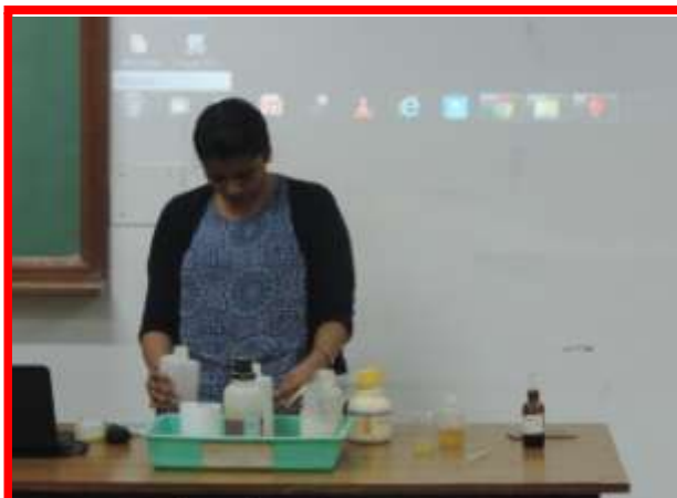
Technical Staff demonstrating Chemistry Experiments during the talk at HBCSE