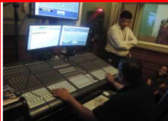
In the Student Recording Room at XIC