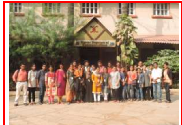
Mentees in front of XIC