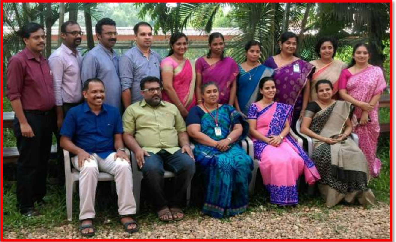
WWS Mentors during 2016-17