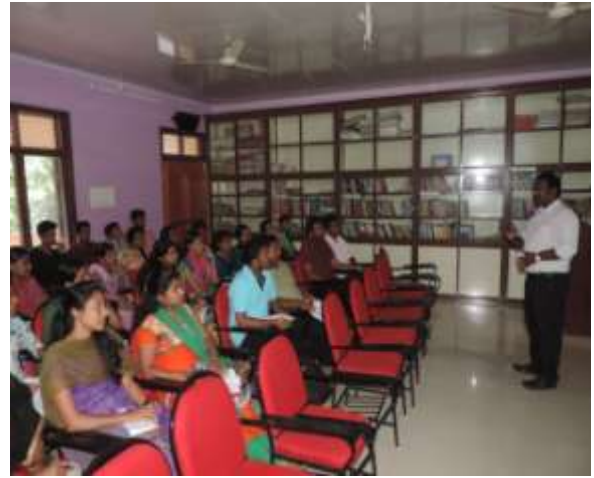
Mentees Interacting during the Session