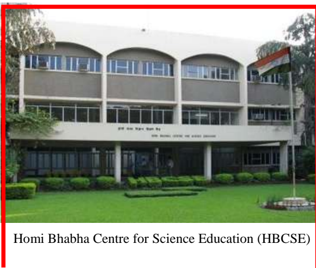
Homi Bhabha Centre for Science Education (HBCSE)