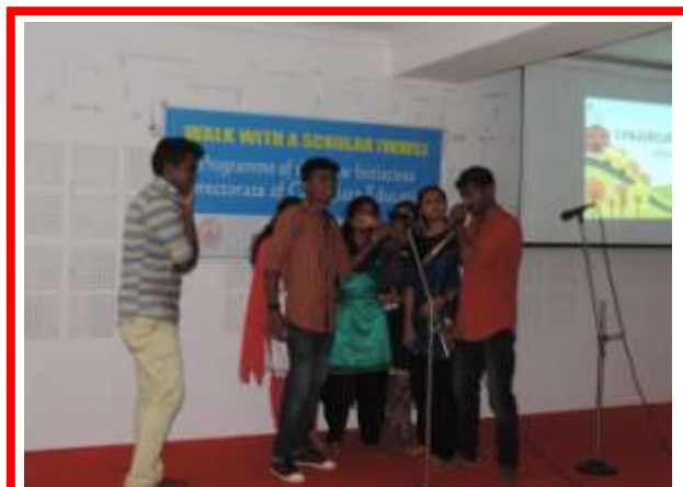
The First Prize Winners of Conjour UP 2K17