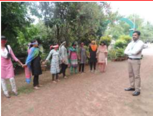
Activity based Training at MACFAST