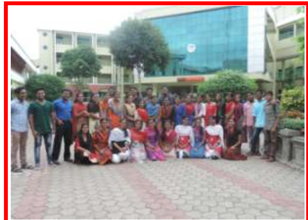
Mentees at the end of the five day session at MACFAST