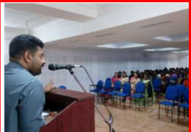
The Mentees during the Session