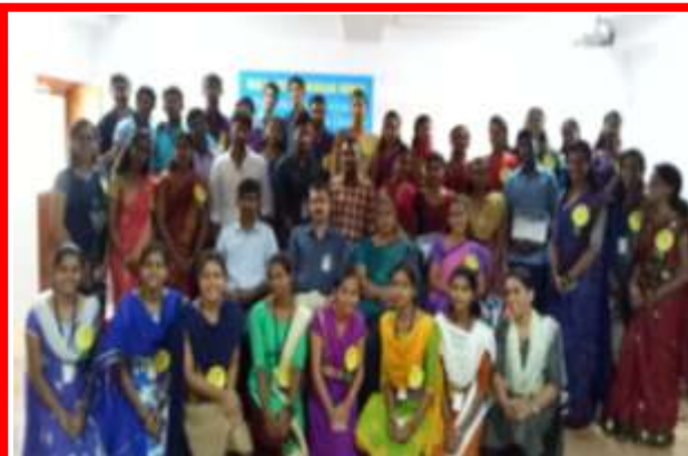
Principal, IQAC Co-ordinator, WWS Co-ordinator and WWS Mentees with Winners