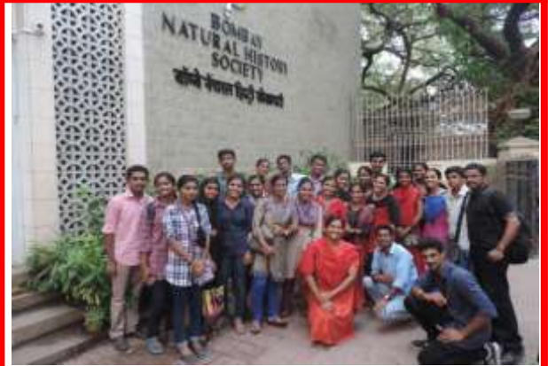
Mentees in front of The Bombay Natural History Museum, Mumbai