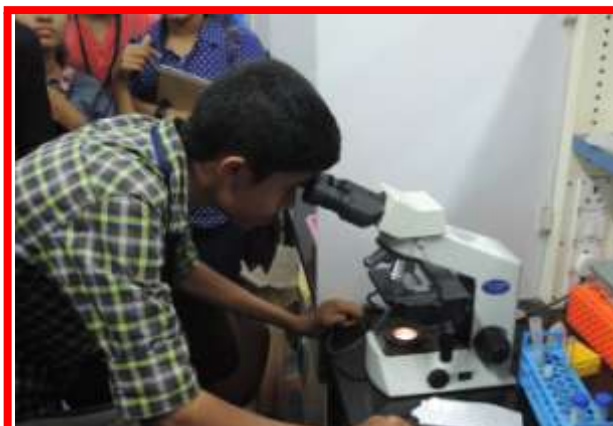
Mentees at the Biology Lab, HBCSE