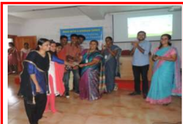
Prize Winners with Principal and Judges