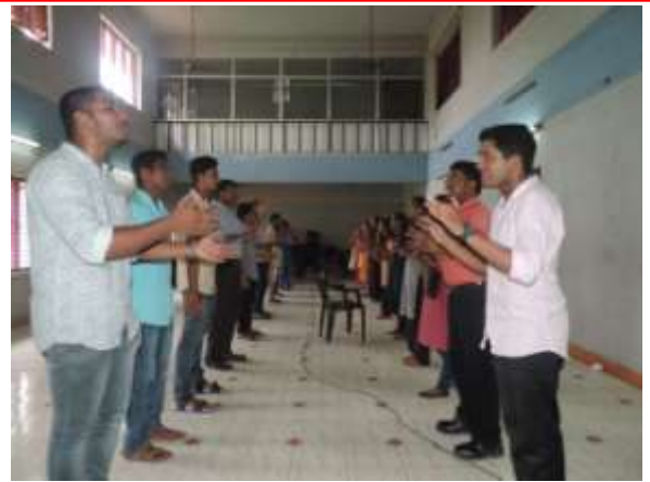
Activity based Training on Communication in English