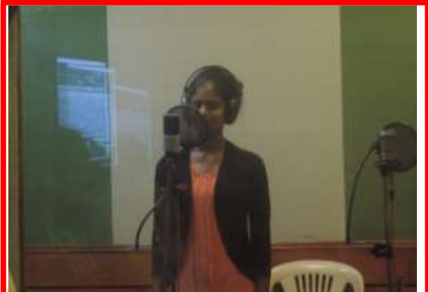
Voice Recording of Mentee at XIC Studio