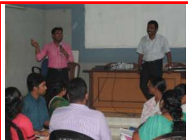
During the Session with mentees on Building Power Resumes