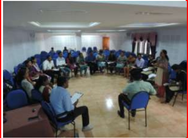
Mentees During the Mock Group Discussion