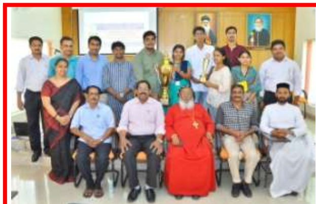
The Prize Winners with the Organising Team