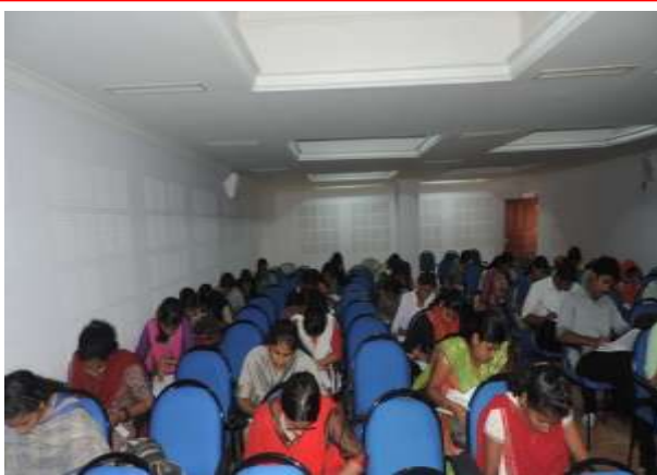
First and Second Year Mentees Attending Mock Aptitude Test