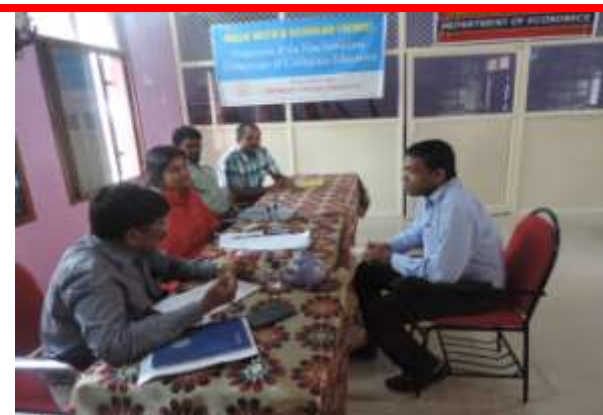
Mock Subject-wise Interview for Mentees