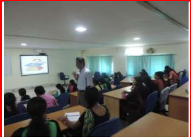
The Group Discussion Session