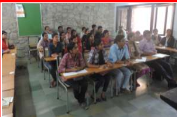
Mentees attending the Orientation at The Tata Institute of Social Sciences, Mumbai