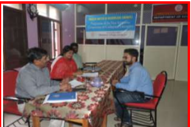
Mentee Attending Mock Subject-wise Interview