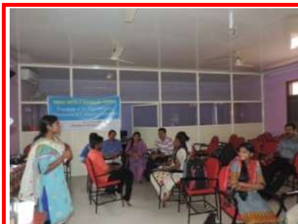
The Mentees Interacting during the session