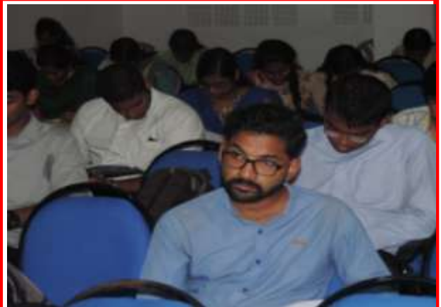
Mock Subject-wise Test of Mentees