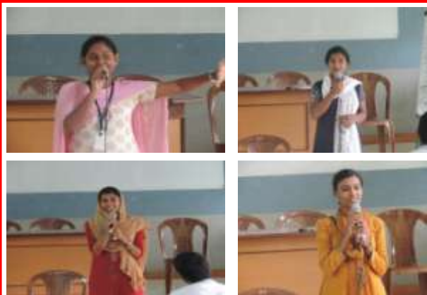
First Year Mentees Providing Feedbacks