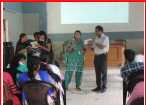
Trainer with Second and first year mentees