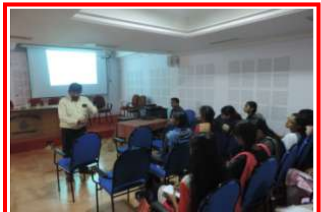
Mentees during Interview Skills Training Session